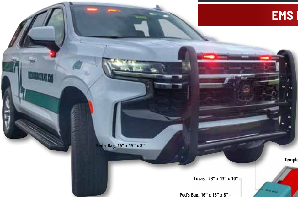
Ped's Bag, 16" x 15" x 8"

FastLane only builds custom solutions, resulting in a vehicle that fits your department's needs.